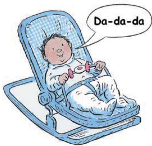
Answer your baby's noises and babbles – he's talking to you!

Talk to your baby or toddler as often as you can. This will help him or her become a good talker and learner, and be confident and happy. Learning to talk is one of the most important skills your child will achieve. It seems to happen naturally, but in fact you have a very important role to play.