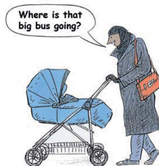
What can you see on the way to the shops?