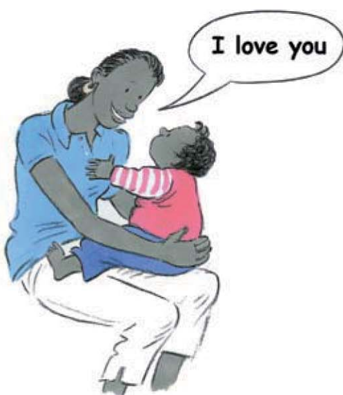
Look at your baby when you talk together