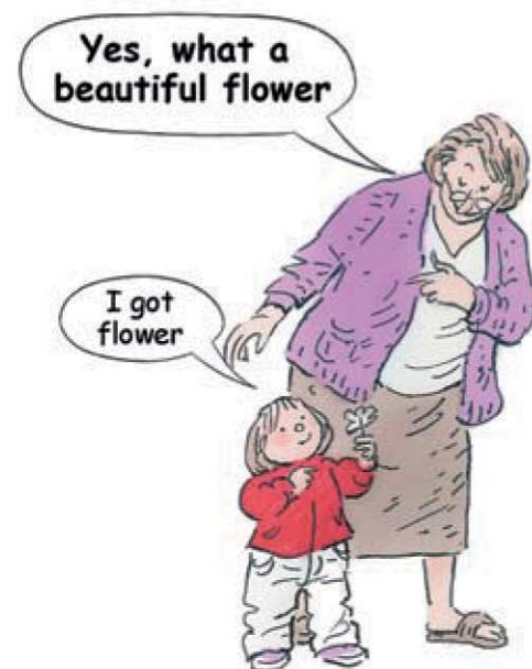
Listen, and give your toddler time to talk