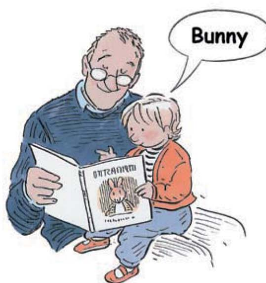
Talk about the pictures in a favourite book