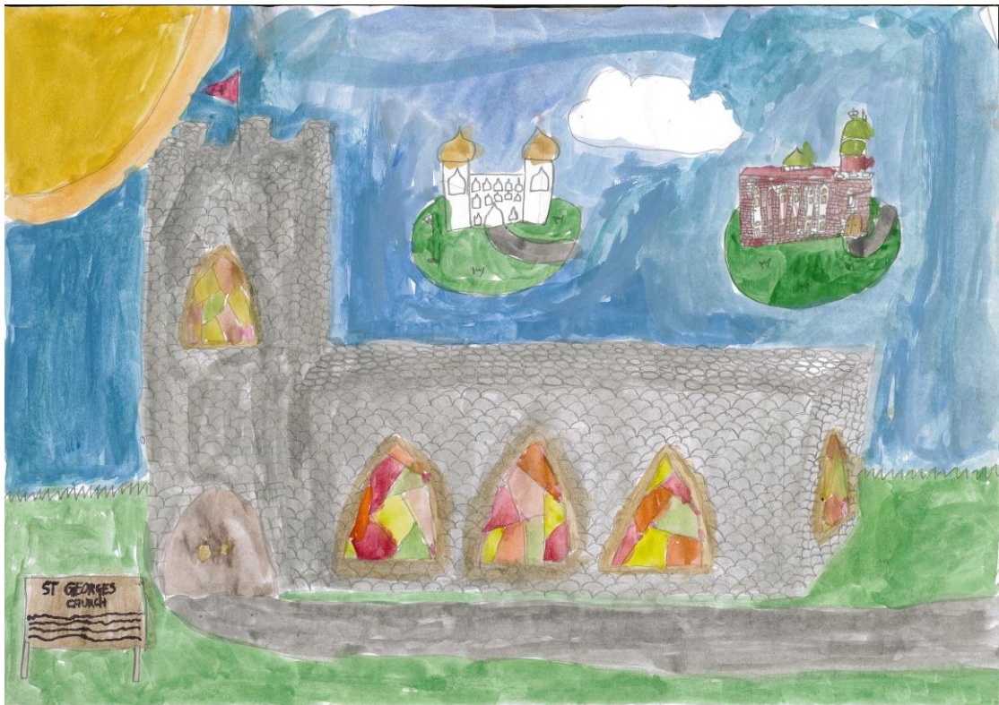
Beth Meachem, age 9