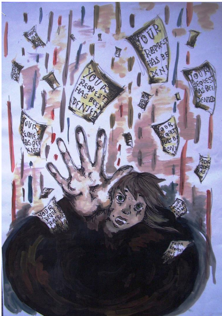
Penny, age 15